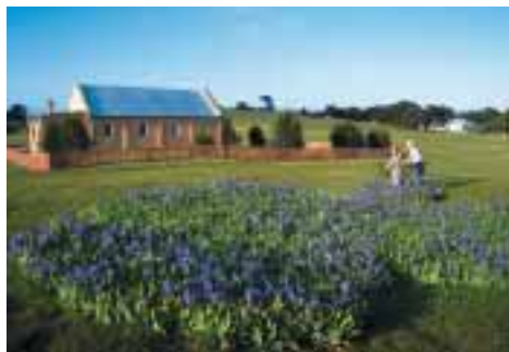
Wybalemma Historical Site

Investment opportunities in tourism exist mainly in niche, high value markets such as nature-based tourism and recreational fishing. Visitor data is available at www.tourismtasmania.com.au/research