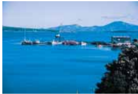
Lady Barron Port

Regular air services connect the Flinders Island Airport, just north of Whitemark, with the Launceston Airport in Northern Tasmania (travelling time approximately 35 minutes), with Bridport on the north east coast of Tasmania