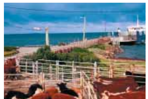
Cattle loading Lady Barron