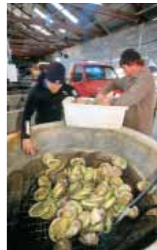
Locally grown abalone

The west coast of Flinders Island and some of the other islands, offer excellent potential sites for wind farms. Investment opportunities in wind farms will increase as the demand for renewable energy increases, although at this stage the absence of a connection to the national grid limits this possibility.