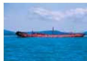
Shipwreck of the Farsund

Considerable scope for further investment in aquaculture