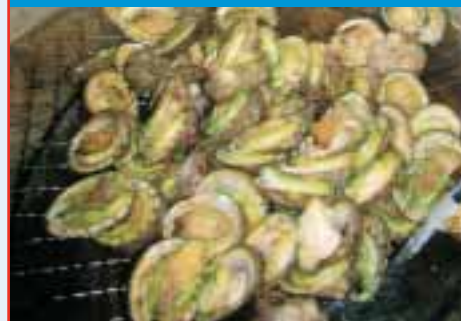
Locally caught abalone

Flinders Island has three main population centres – Whitemark, Lady Barron and Killiecrankie. Whitemark is the main residential and business centre. The all-tides port at Lady Barron is the berthing port for the inter-island and inter-state trading vessels Matthew Flinders and Southern Condor .