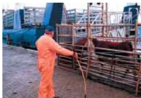
Cattle loading at Whitemark

Employment in agriculture and fishing declined sharply between 1986 and 1991 from 214 to 138, due to a significant State-wide decline in the fishing industry in the late 1980s, but has remained static at about 140 since 1991.